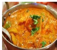
King Prawn Balti