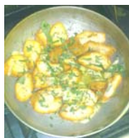
Garlic Chicken Chatt