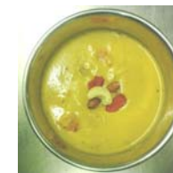
Shahi Korma Murg