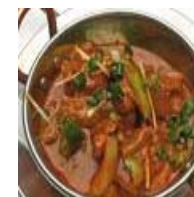
Chicken Do piazza

Any of the above dishes served with king prawn will be £9.95