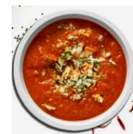
Lamb Tikka Masala