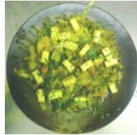
Sobzi paneer tawa