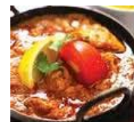
Chicken tikka karahi