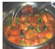
Chicken Mirch Bom